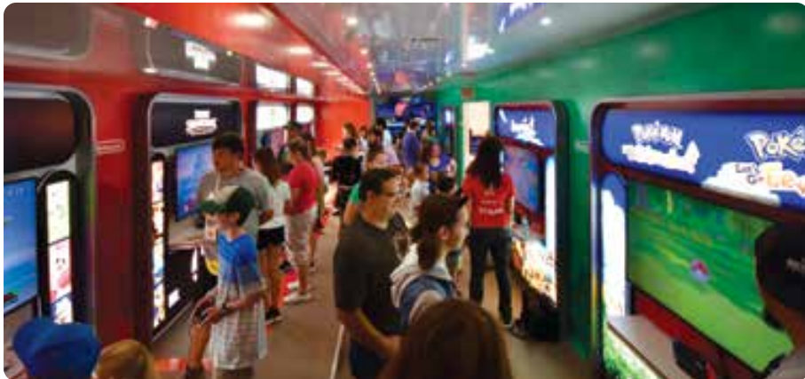
SINGLE EXPANDABLE AIR CONDITIONED INTERIOR