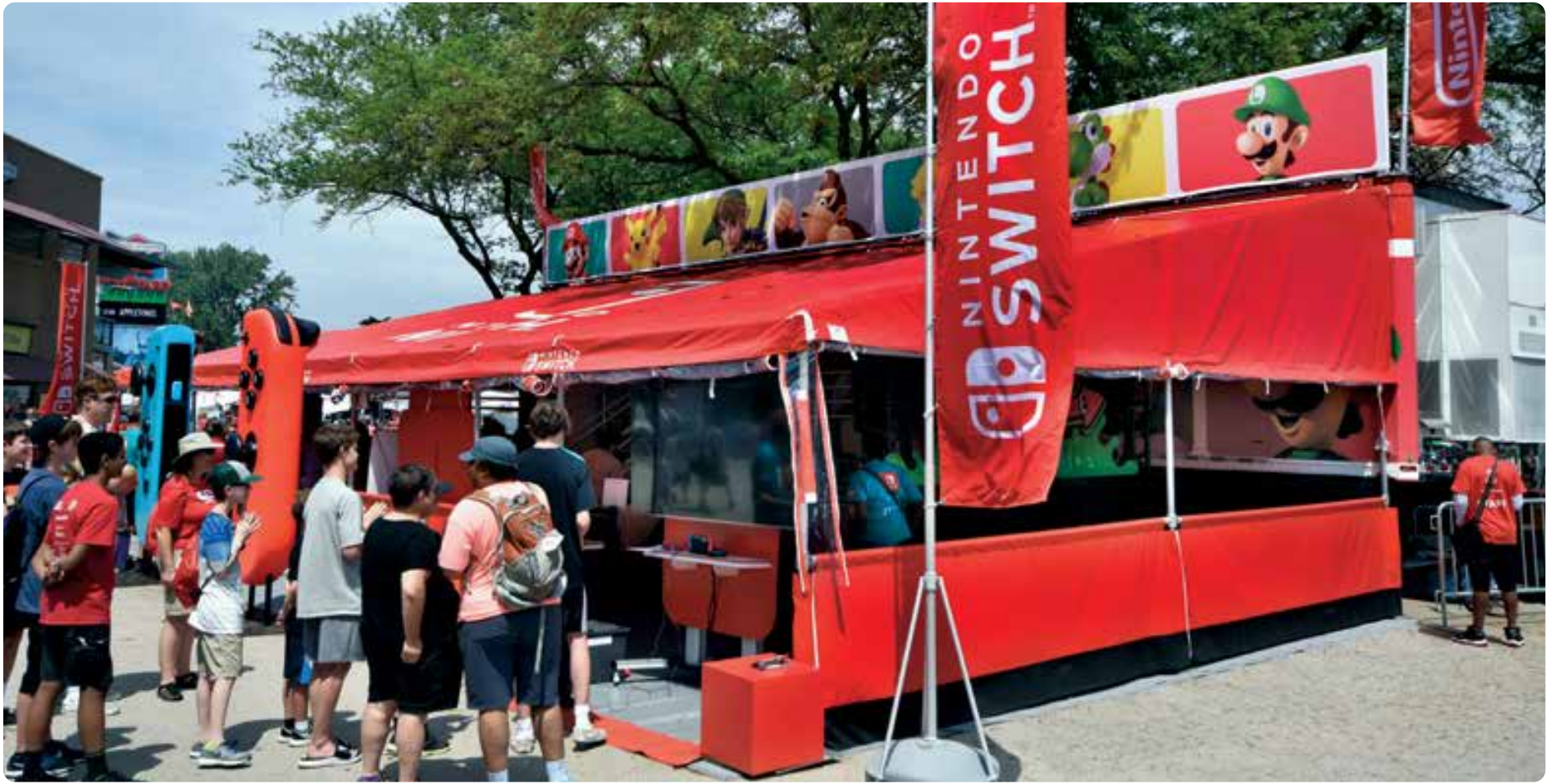
24' X 53' FRAME AWNING WITH NIGHT CURTAINS