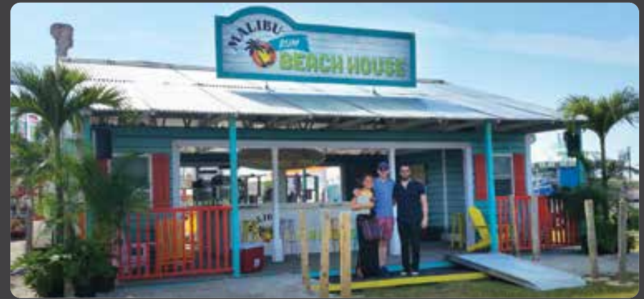
40' X 30' CUSTOM STRUCTURE / MULTI DAY CONCERT EVENTS