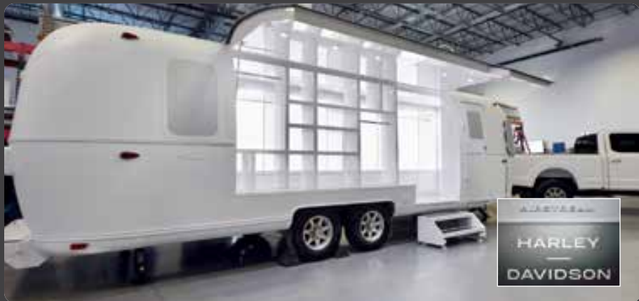
POP UP RETAIL