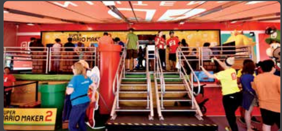
53' EXPANDABLE STAGE TRAILER / GAMING EXPERIENCE