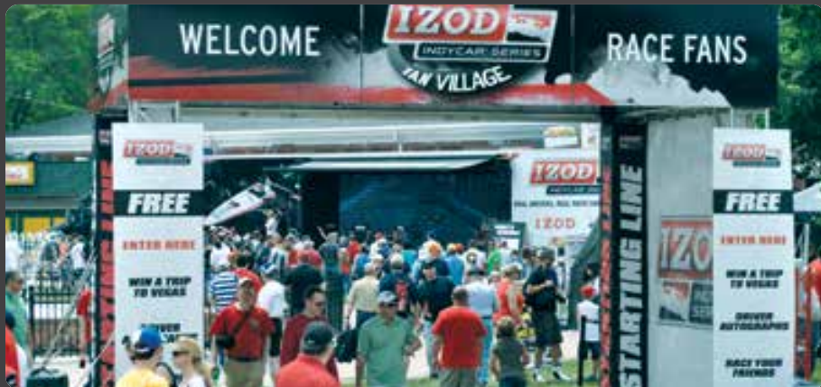
200' X 200' FAN VILLAGE