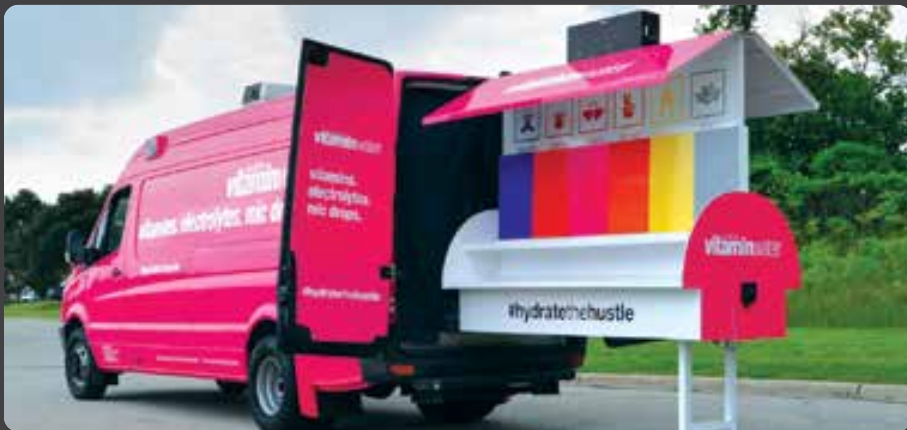
EXCLUSIVE BOLT IN / 5 MINUTE SETUP