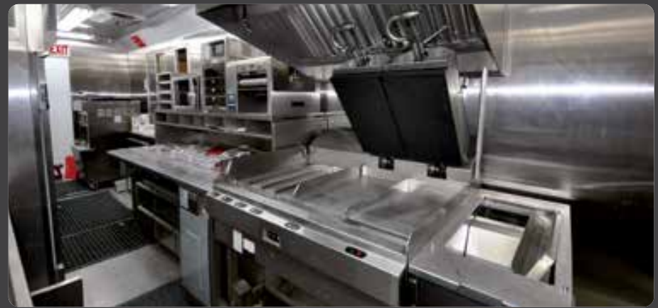
CUSTOM KITCHENS / HEALTH CODE COMPLIANT