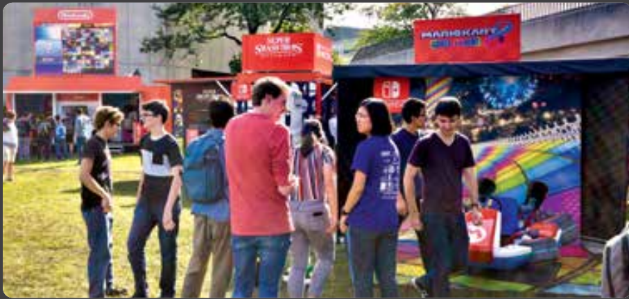
100' X 100' EVENT SITE MULTIPLE ASSETS / COLLEGE GAMING TOUR