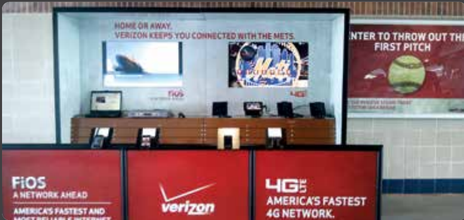
18' STADIUM DUGOUT / INTERACTIVE KIOSK