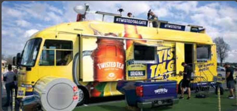
40' COACH WITH ROOFTOP DECK / NASCAR TOUR