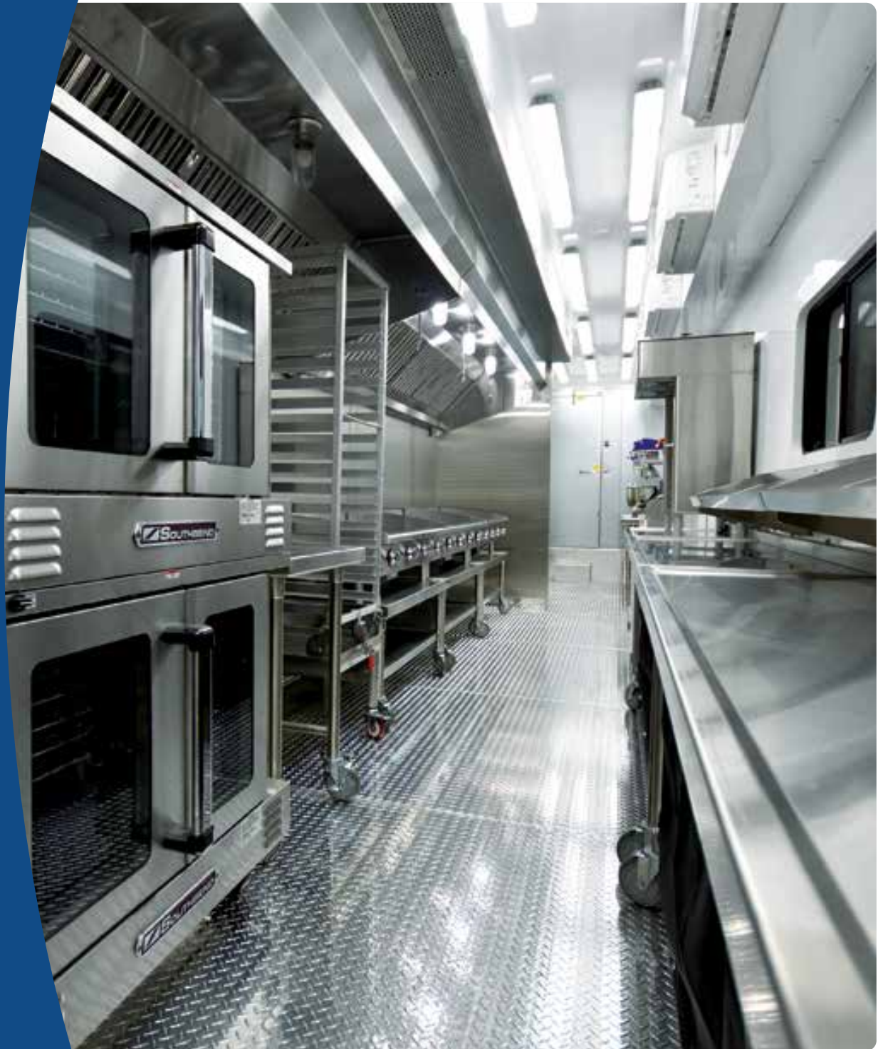
HEALTH CODE COMPLIANT MOBILE KITCHENS