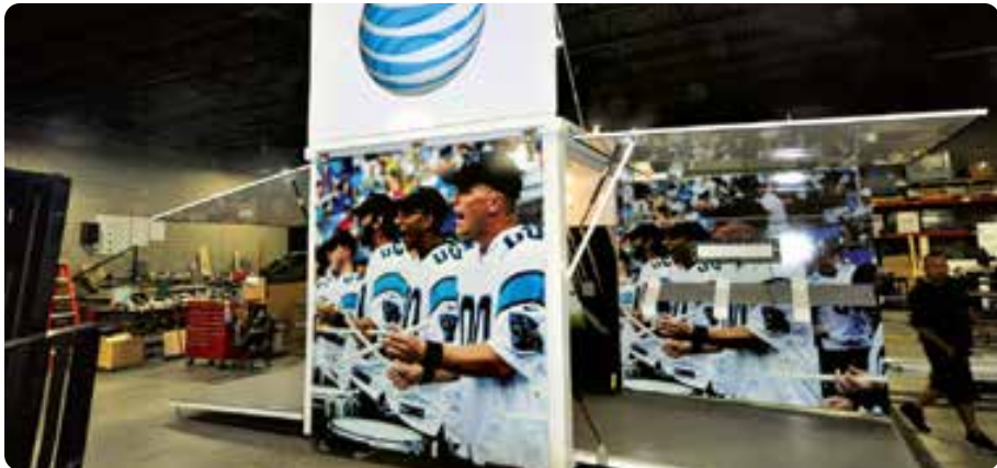
SWING OUT WALLS AND FOLDING MARQUEE