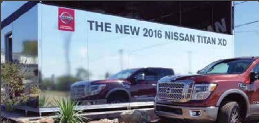
EXCLUSIVE PANEL STRUCTURE