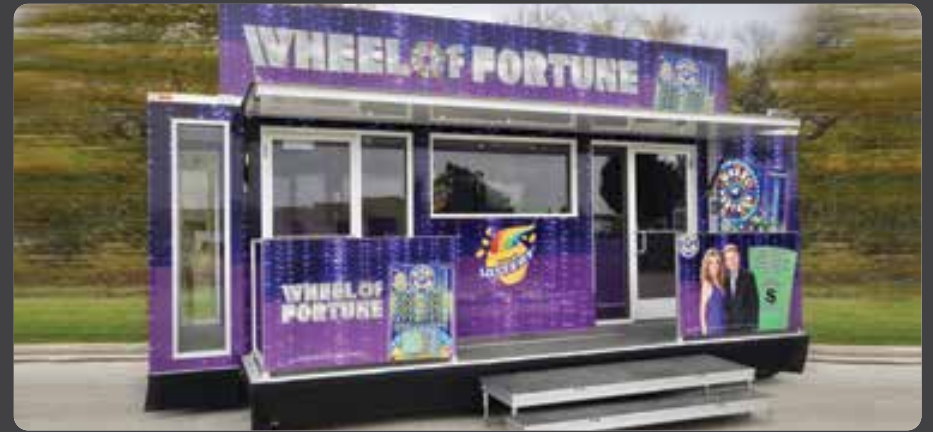
PATENTED EXT TRAILER