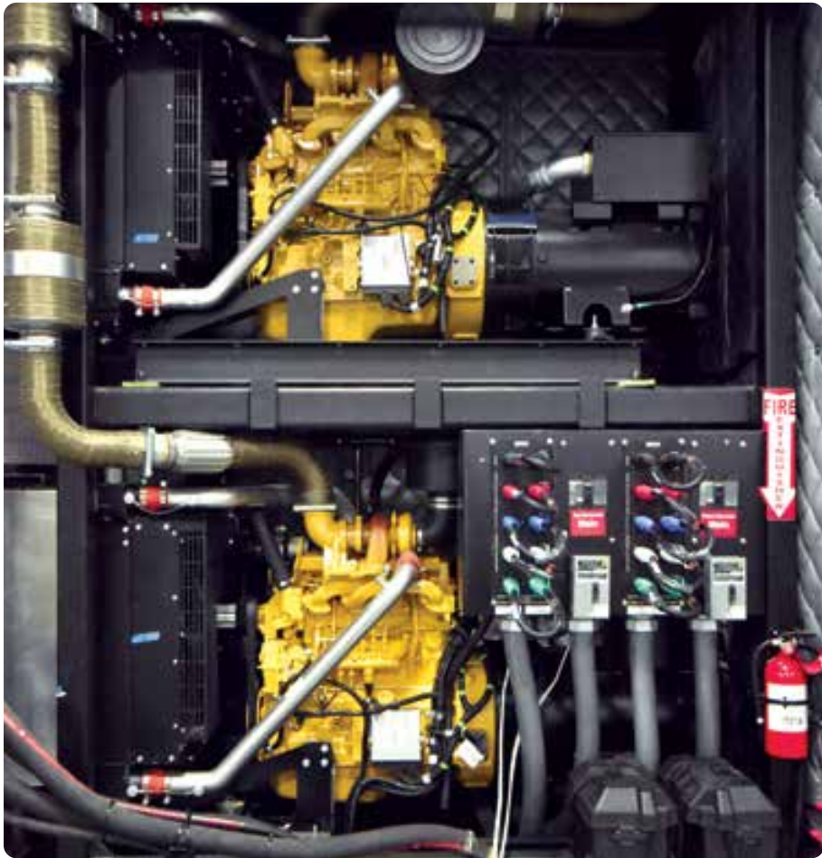
BUILT IN POWER SYSTEMS