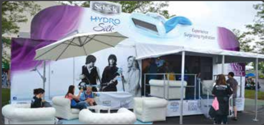
40' STAGE GOOSENECK / CONCERT LOUNGE SPONSORSHIP