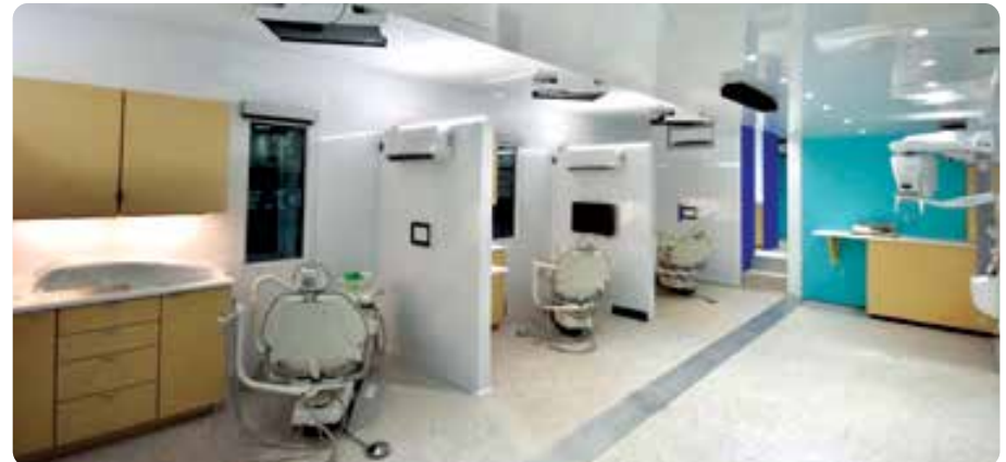
9' INTERIOR HEIGHT