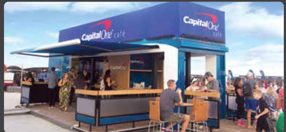
40' DROP TRAILER / CAFÉ