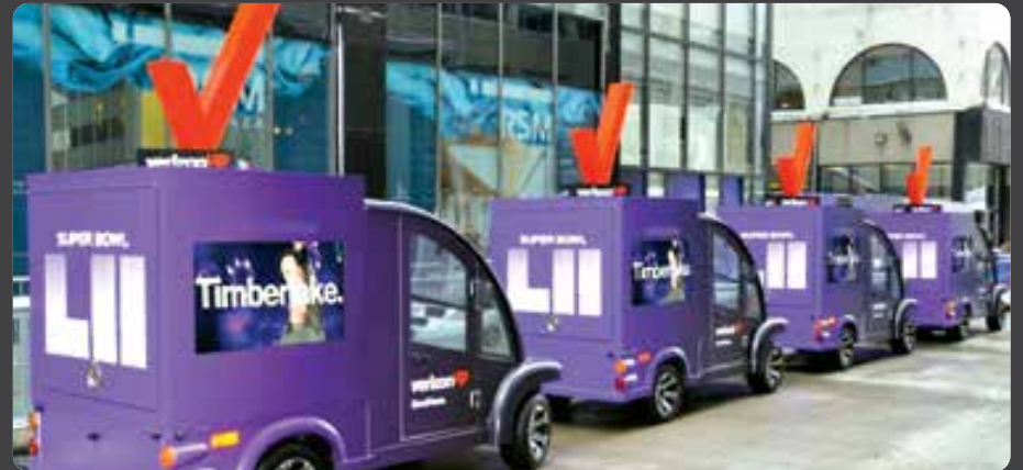
ELECTRIC DISPLAY VEHICLE