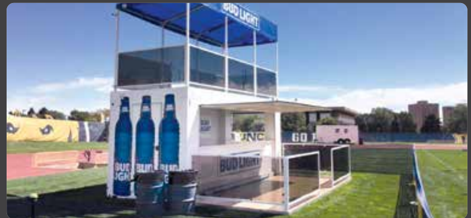
20' CONTAINER WITH ROOFTOP DECK / BAR