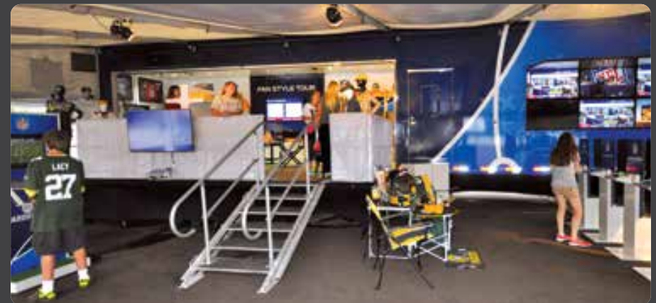
53' SEMI STAGE / NFL TOUR