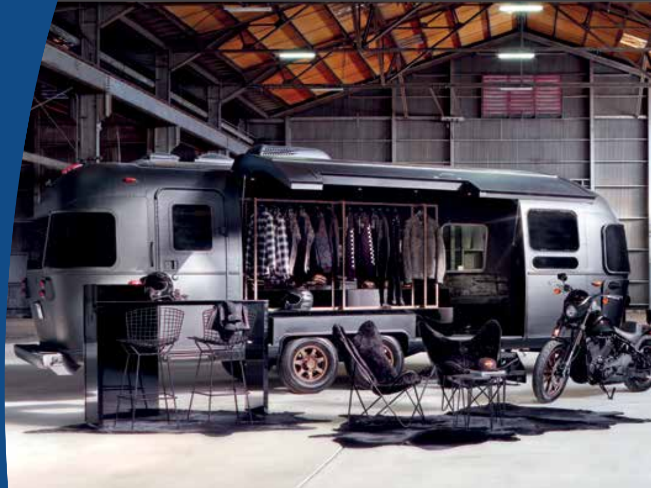
OPEN CONCEPT AIRSTREAM FOR POP-UP RETAIL