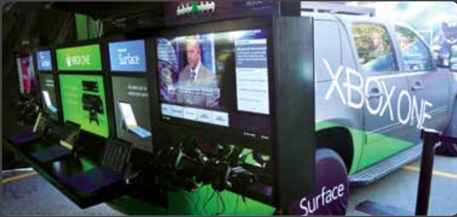
SUV BOLT IN / GAMING