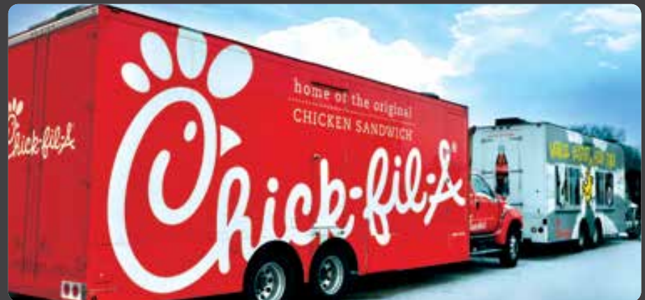
26' BOX TRUCK / RETAIL