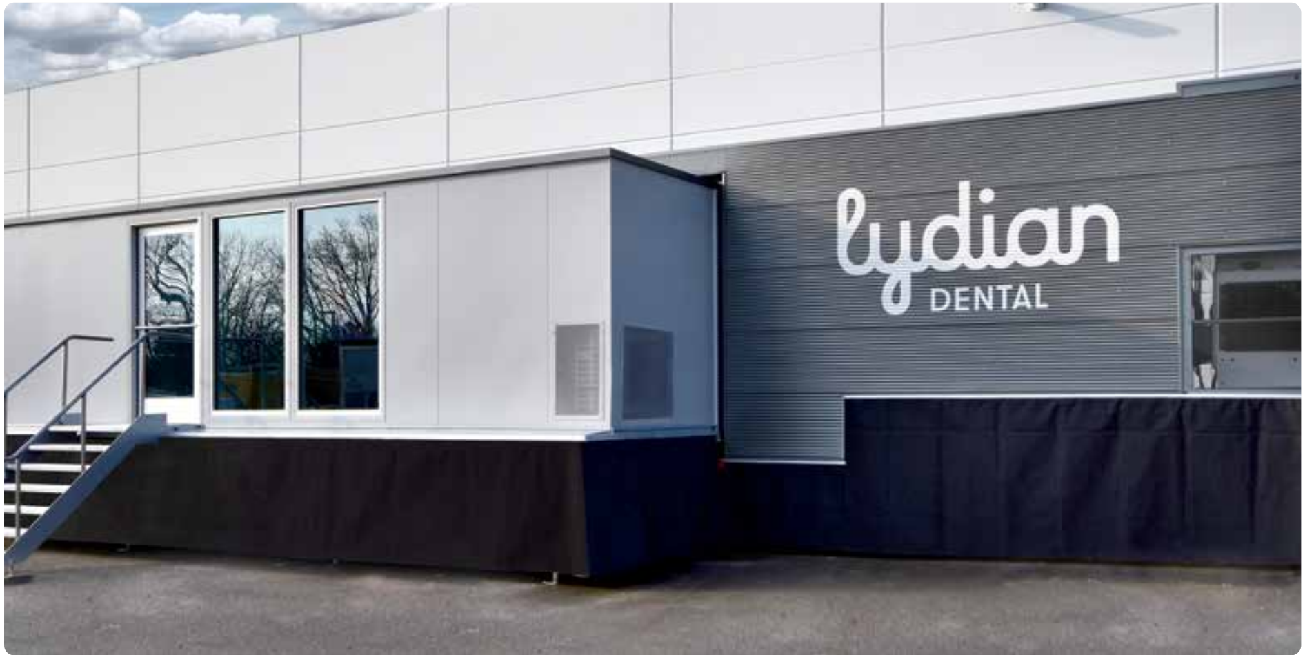
EXTERIOR DESIGNED TO LOOK MORE LIKE A BUILDING THAN A TRAILER