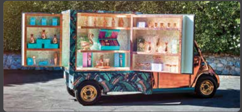
GEM ELECTRIC CAR / MOBILE BAR