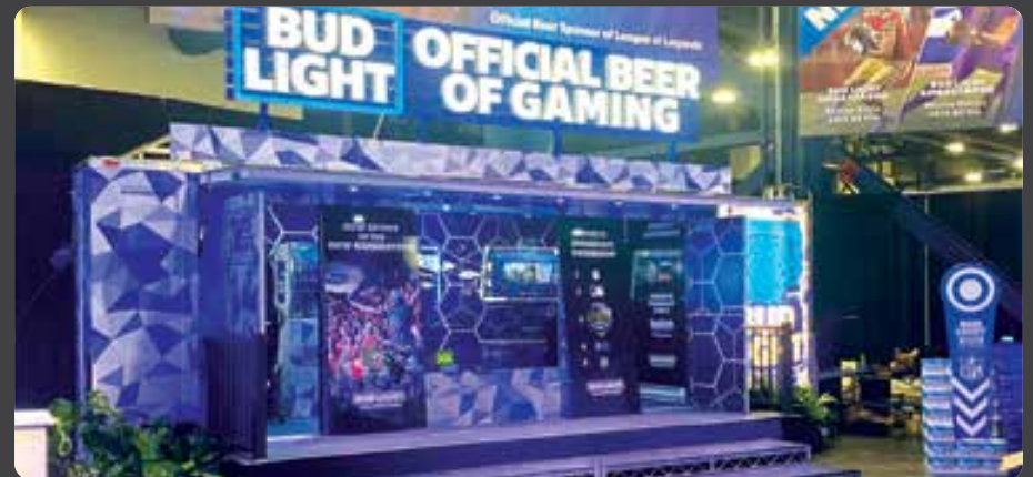
PATENTED EXT / PROMOTIONAL