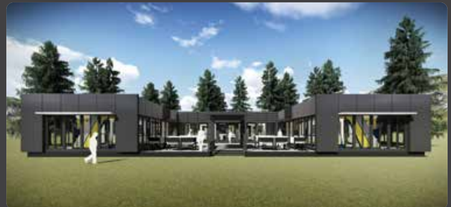
ARCHITECT SERIES "U" SHAPE WITH COURTYARD