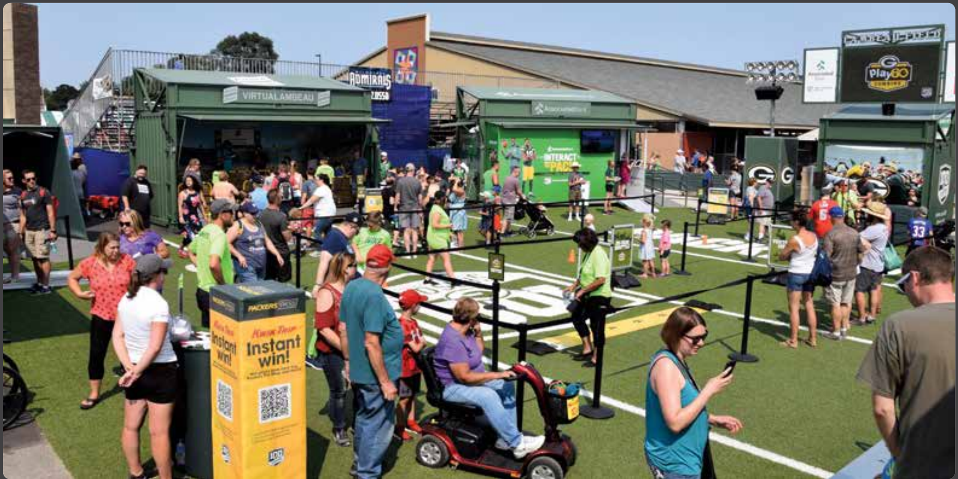
8 INDIVIDUAL ELEMENTS TO CREATE ONE LARGE EVENT