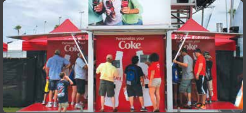
8' POD / VENDING MACHINE