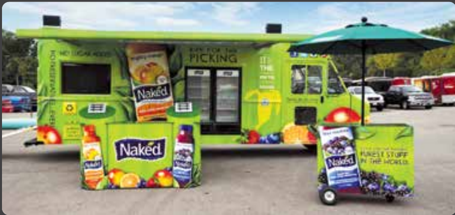
STEP VAN / SAMPLING