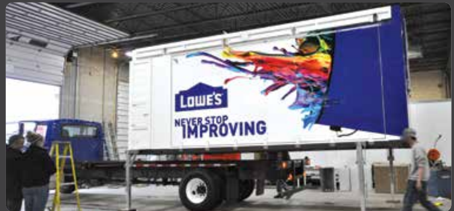
EASY TO SET AND STRIKE