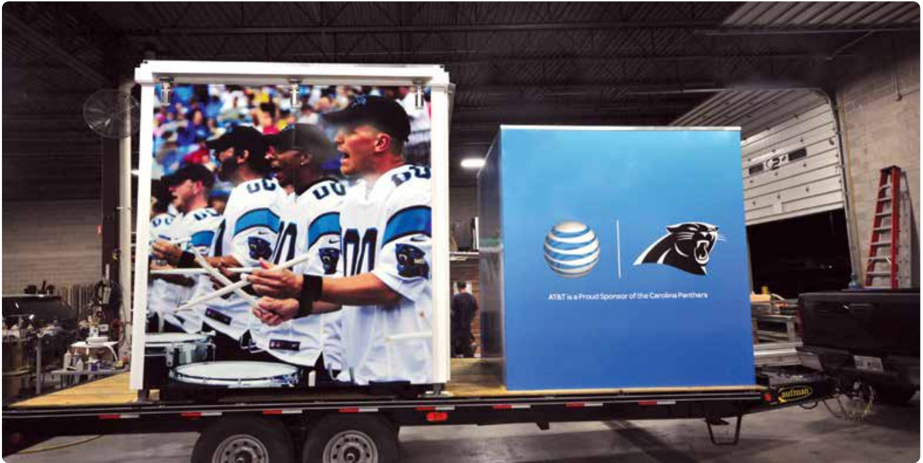
LOCKS ONTO FLATBED WITH ISO BLOCKS AND STORAGE FOR OFF BOARD KIOSKS