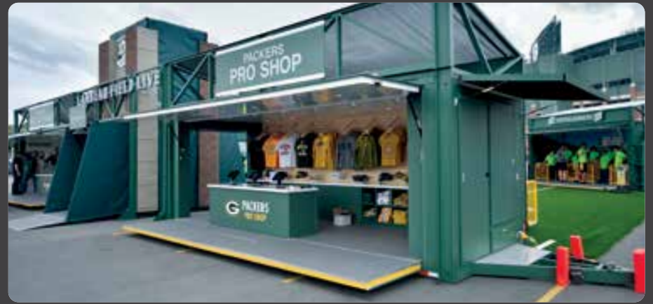
24' PATENTED DROP TRAILER