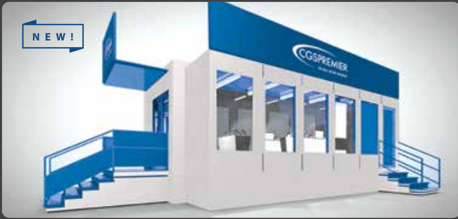
EXCLUSIVE EXPANDABLE GOOSENECK