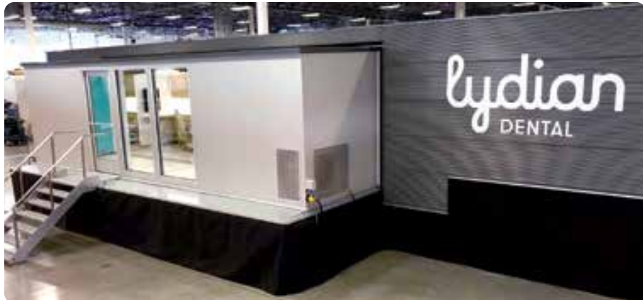
WINDOWS ALLOW NATURAL LIGHT WITH AN OPEN FEELING