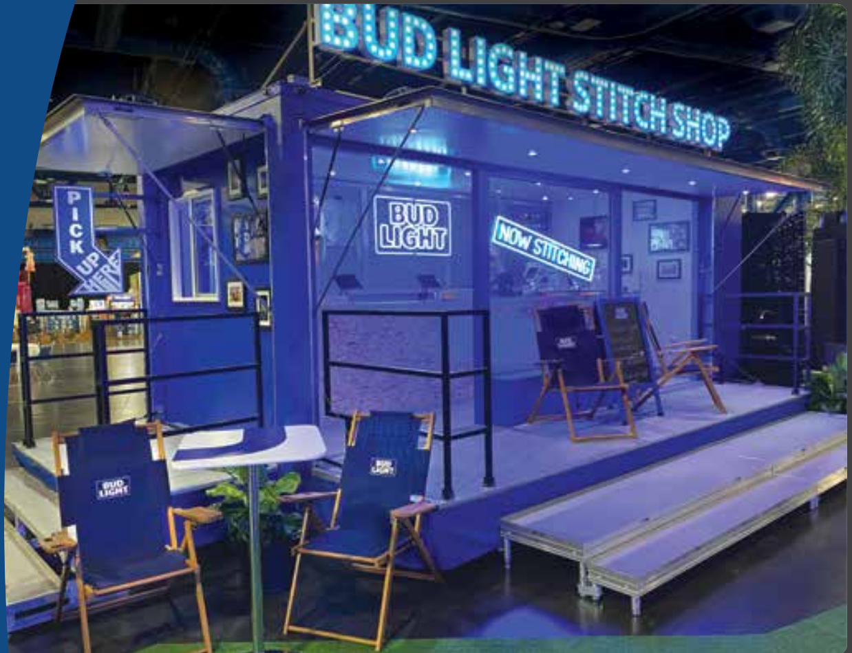
PATENTED EXT TRAILER / 20 MINUTE SETUP