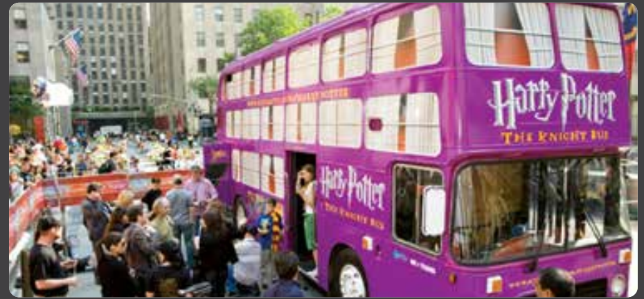
30' ENGLISH BUS DOUBLE DECKER BOOK TOUR