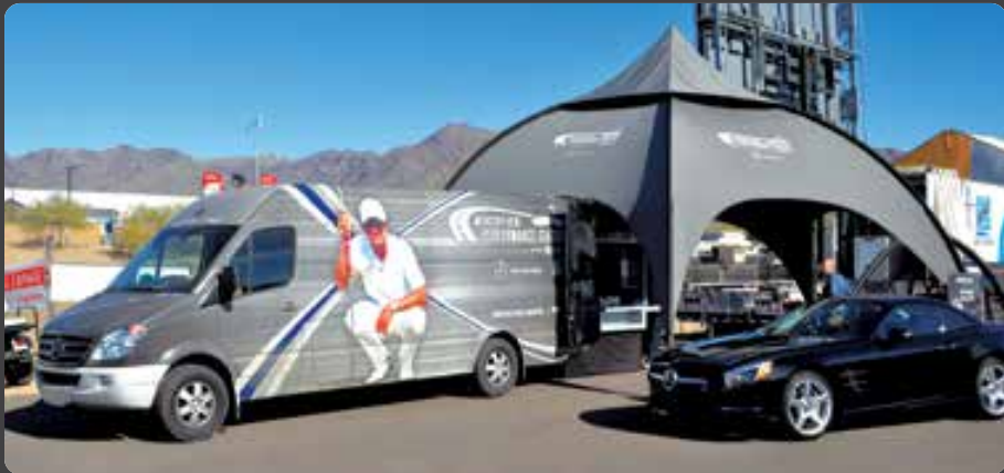
EXCLUSIVE BOLT IN / RETAIL