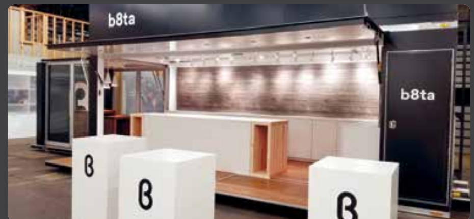
PATENTED DROP TRAILER / 20 MINUTE SETUP

*PAT. NO. US 9,868,380 *PAT. NO. US 9,896,017