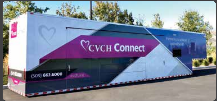
PATENTED DROP TRAILER / CLINIC