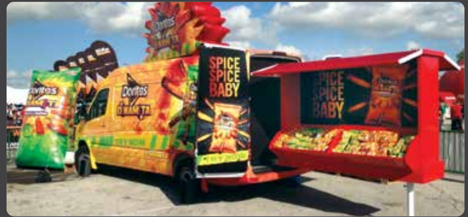
CGS EXCLUSIVE BOLT-IN / SAMPLING TOUR