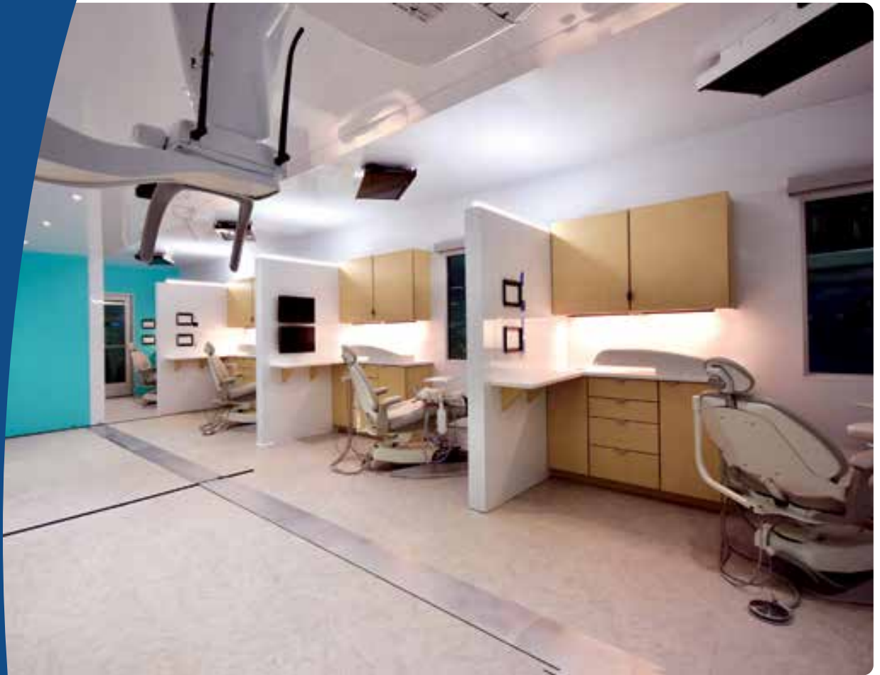
CUSTOM 4 OPP MOBILE DENTAL CLINIC