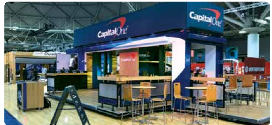
INDOOR AT NCAA FINAL FOUR