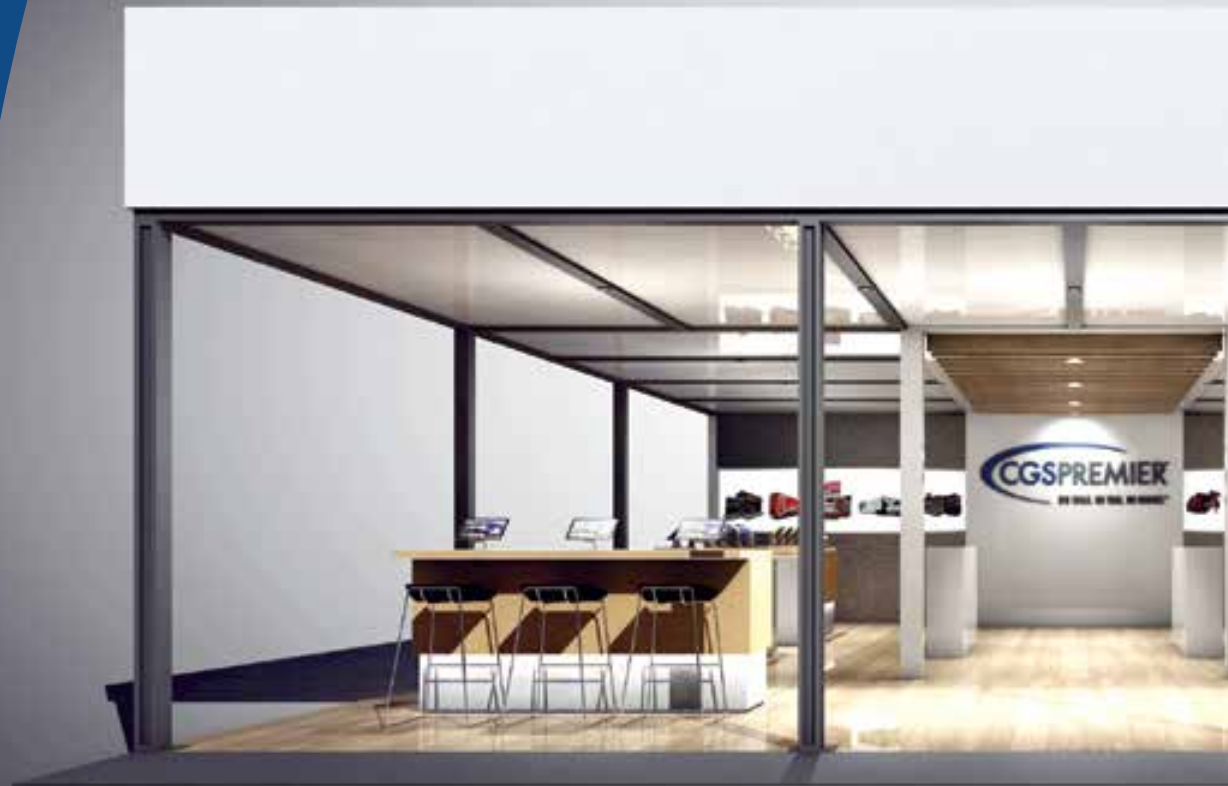
PATENT PENDING ARCHITECT SERIES DROP TRAILER / ONE DAY SET AND STRIKE