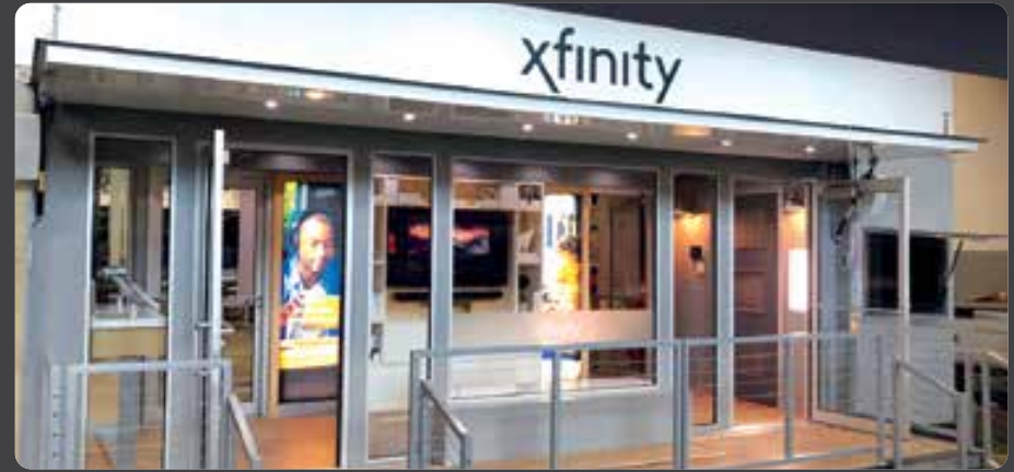
24' PATENTED EXT SMART HOME