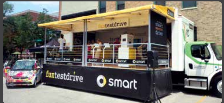
26' STAGE BOX TRUCK / TEST DRIVE