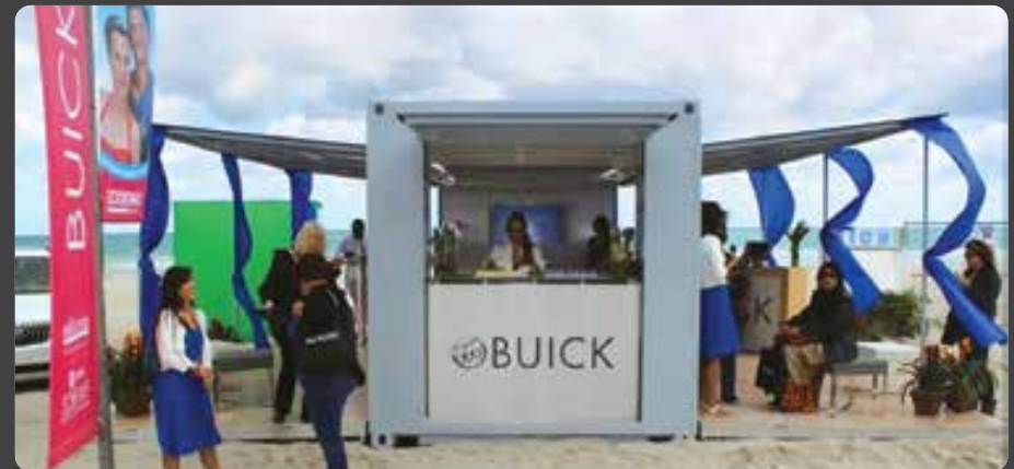
20' DEMOUNTABLE CONTAINER