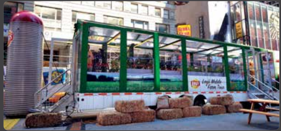
40' GOOSENECK / WORKING GREENHOUSE