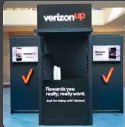
4' MINI POD / MALL KIOSK