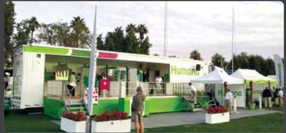
53' STAGE SEMI TRAILER / HEALTH SCREENING