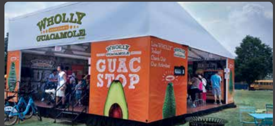
CGS EXCLUSIVE PANEL STRUCTURE