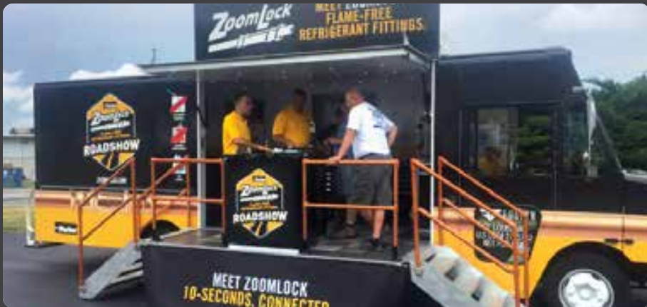
STREET VAN / MOBILE SHOWROOM