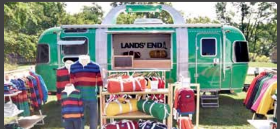
26' AIRSTREAM POP UP RETAIL