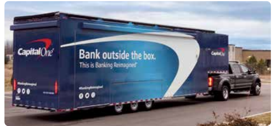
36' PATENTED GOOSENECK DROP TRAILER

*PAT. NO. US 9,868,380 *PAT. NO. US 9,896,017