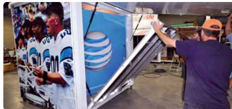
8' POD WITH FOLD DOWN STAGES