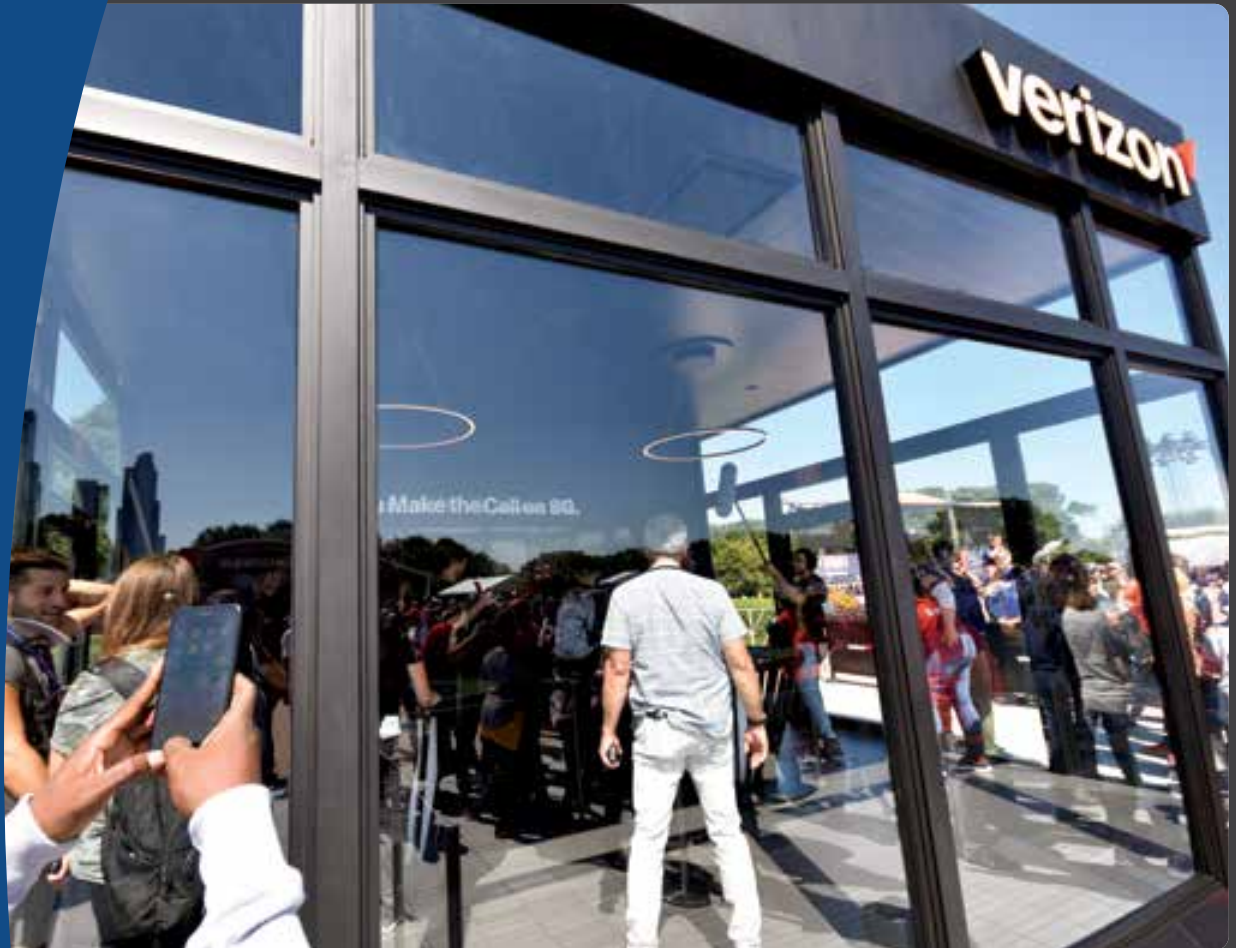
PATENT PENDING ARCHITECT SERIES