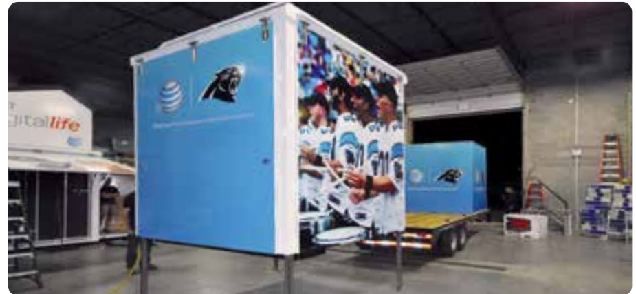
INTEGRATED HYDRAULIC LEG SYSTEM