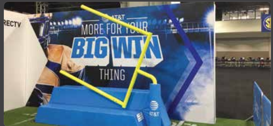
CUSTOM PHOTO OP