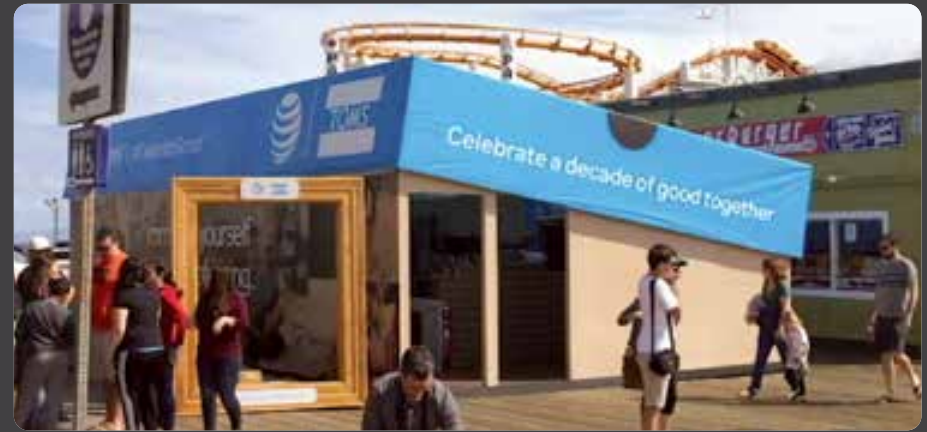
40' X 20' SHOE BOX STRUCTURE / PR EVENT