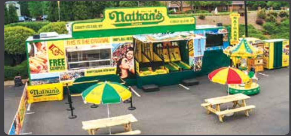
40' GOOSENECK TRAILER / MOBILE KITCHEN AND CARNIVAL GAMES