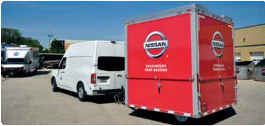
8' PATENTED MANUAL DROP TRAILER