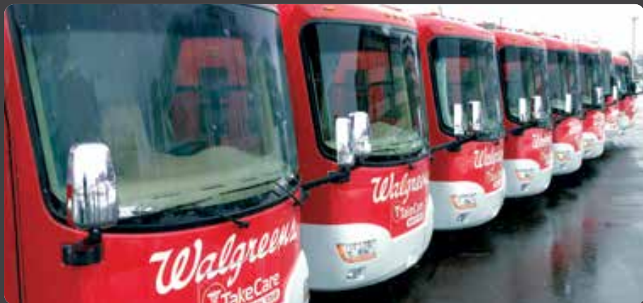
38' COACHES / HEALTH SCREENING