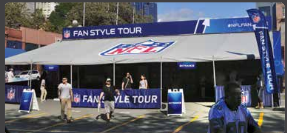
53' SEMI STAGE WITH AWNING / RETAIL