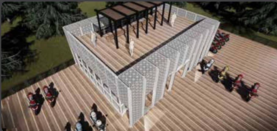
ROOFTOP VIEWING DECK WITH CUSTOM FASCAD