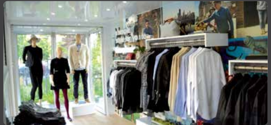
THE GAP / TRY AND BUY ON-SITE