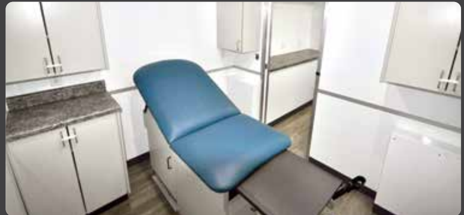
28' PATENTED DROP TRAILER / CLINIC