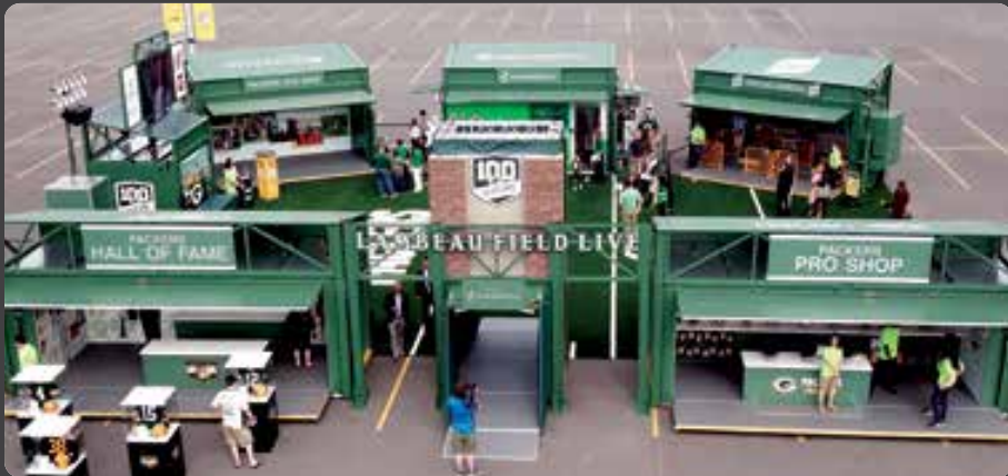
80' X 80' SCALABLE EVENT SITE / LAMBEAU FIELD LIVE