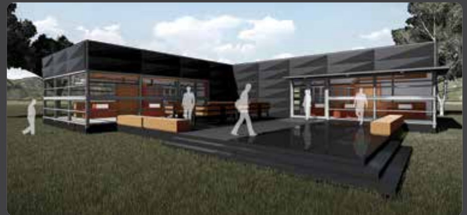
40' X 40' DIMENSIONAL "L" SHAPED ARCHITECT SERIES