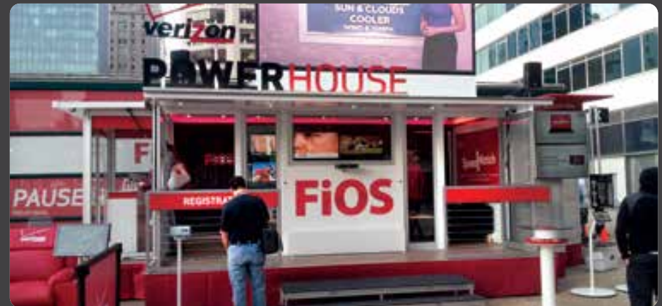
26' BUMPER PULL WITH ROOFTOP LED SCREEN / HOME ENTERTAINMENT