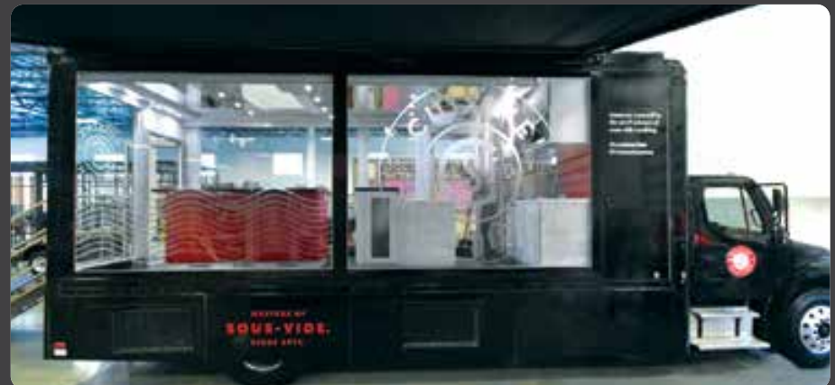
26' BOX TRUCK WITH GLASS BODY KITCHEN