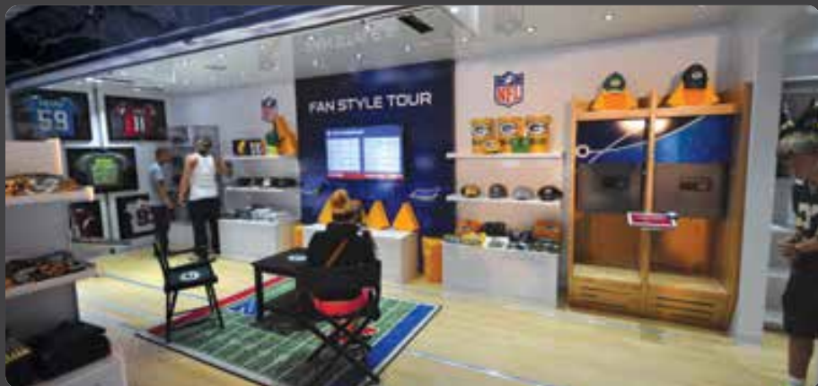
53' SEMI / PRO SHOP STORE