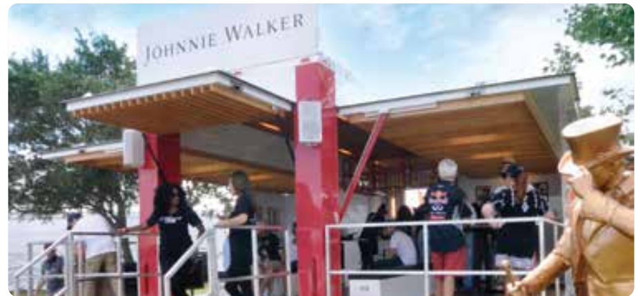
3 SIDED / PATENTED EXT DESIGN