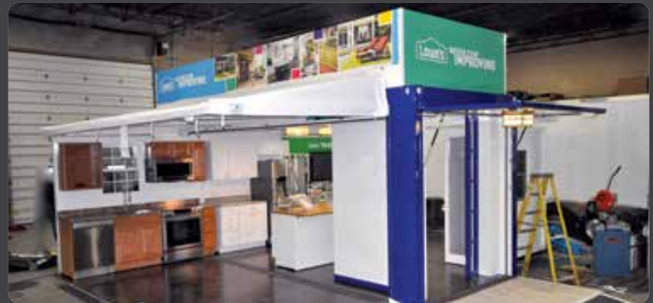
DEMOUNTABLE CONTAINER / POP UP RETAIL