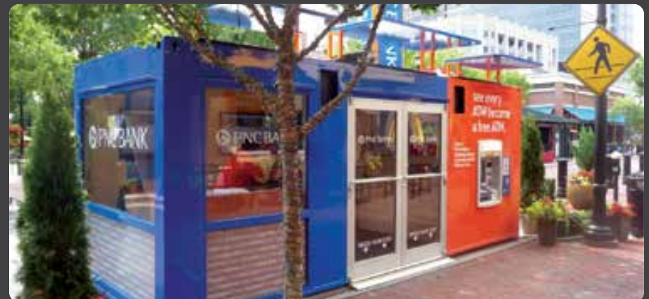
20' SHIPPING CONTAINER / BANK BRANCH