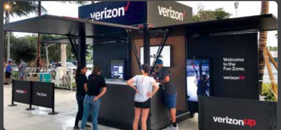
8' PATENTED DROP TRAILER / FAN ZONE