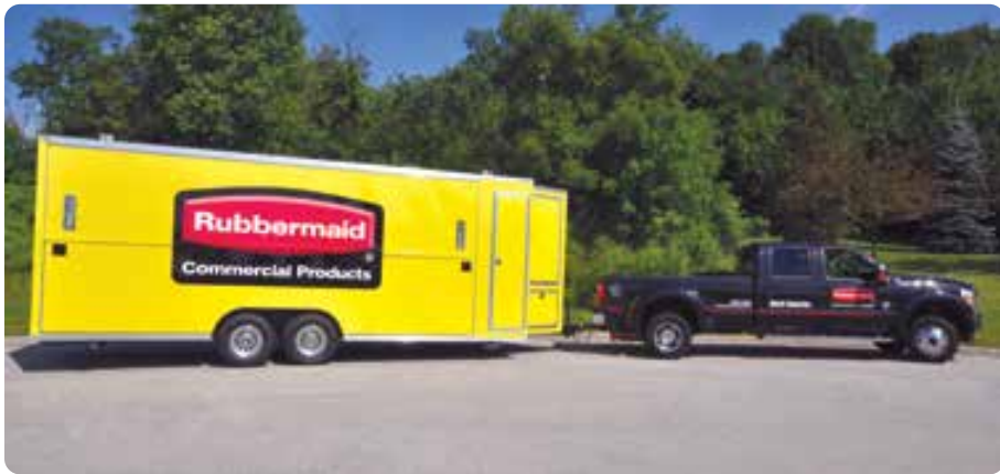
1 SIDED / PATENTED EXT TRAILER