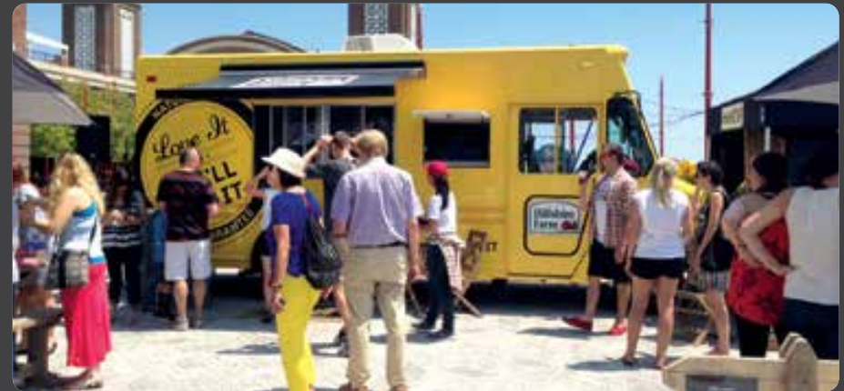
SAMPLING STEP VANS