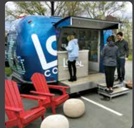
16' CLAM SHELL