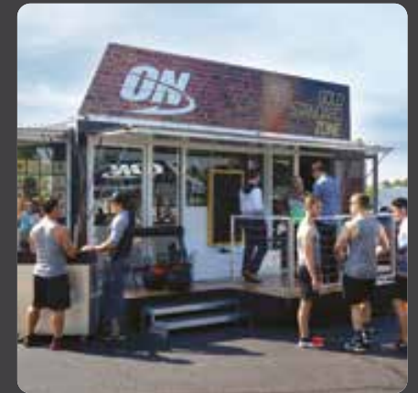
RETAIL DISPLAY TRAILER