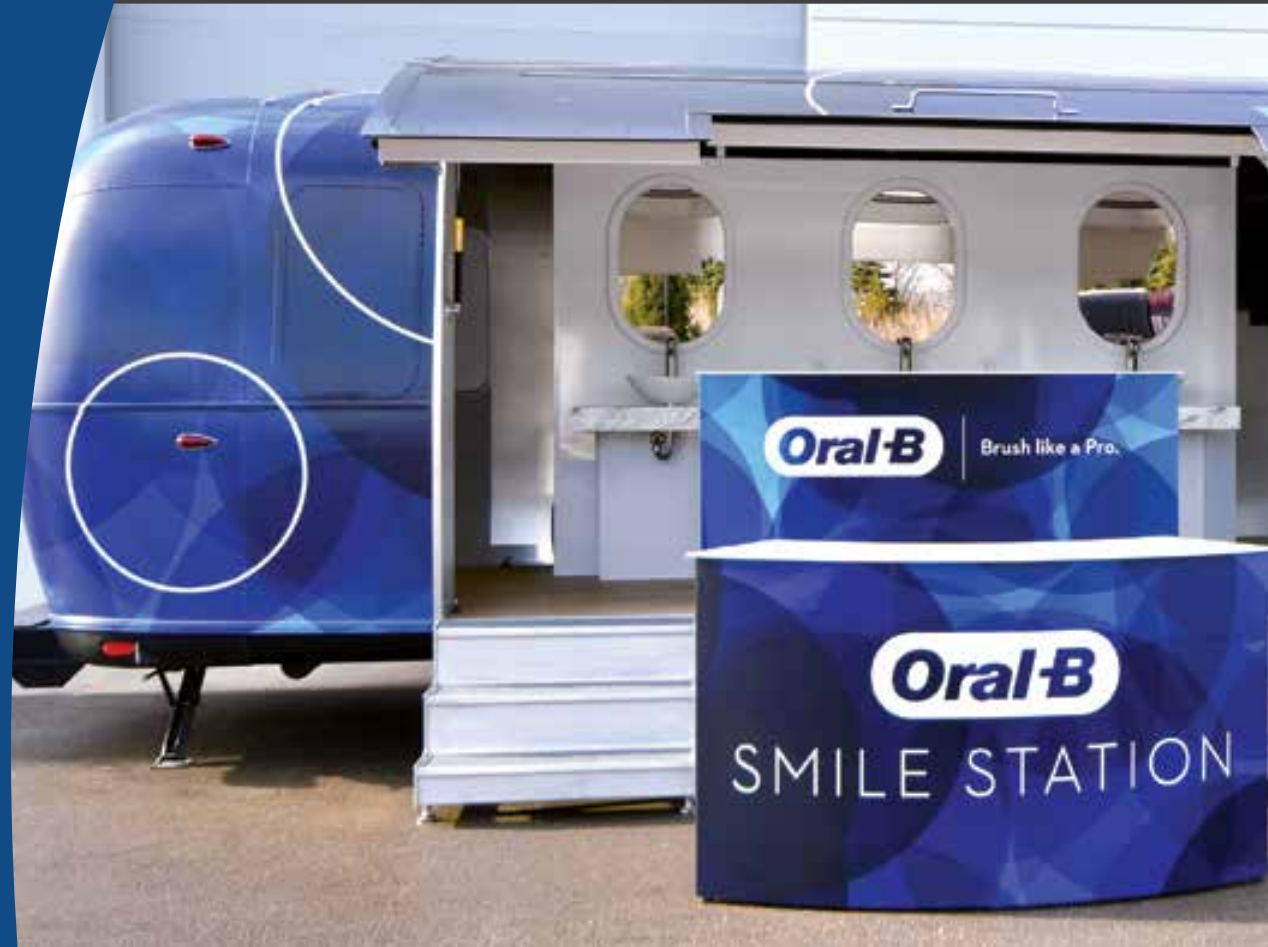
INTERACTIVE CUSTOM OPEN CONCEPT