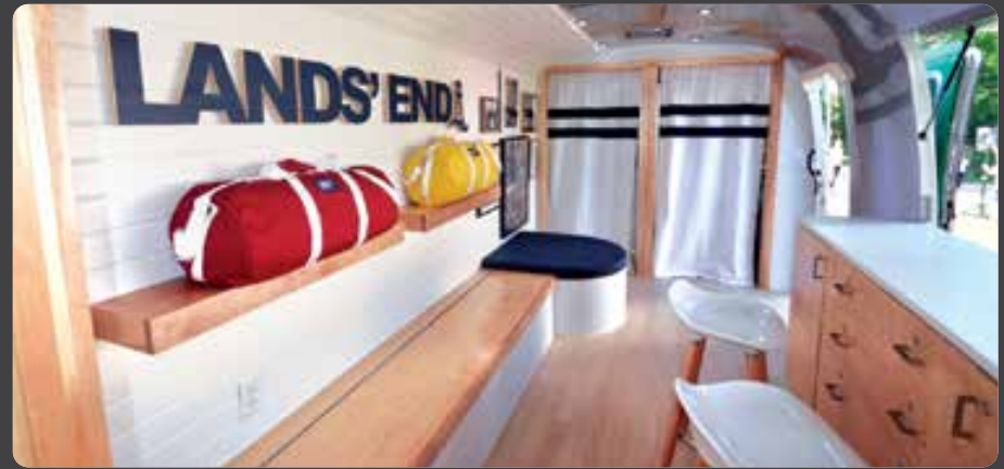
26' AIRSTREAM POP UP RETAIL