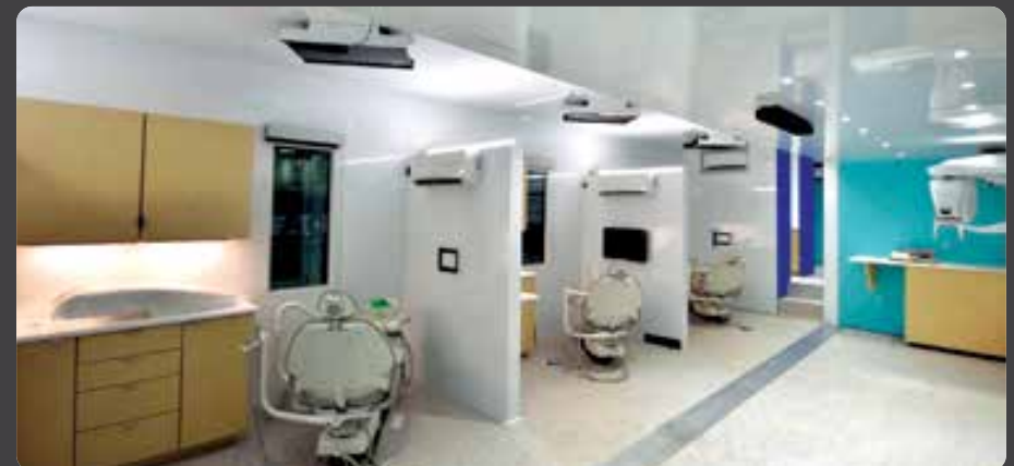
53' EXPANDABLE SEMI / 4 OPP DENTAL CLINIC