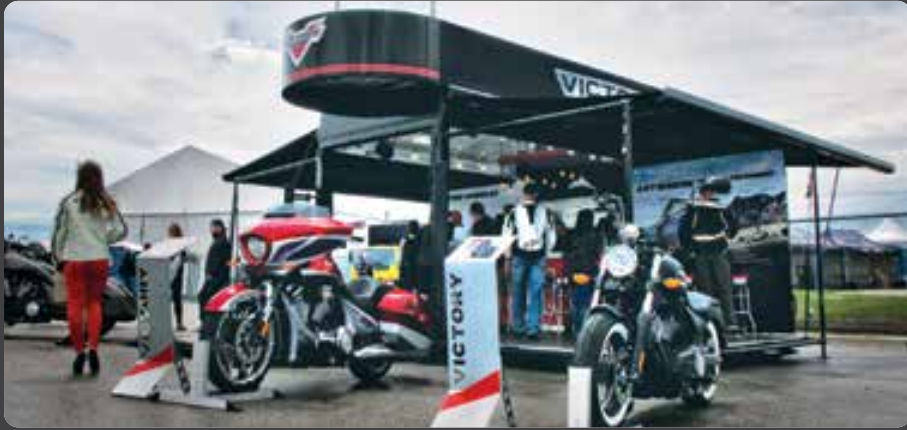
20' SHIPPING CONTAINER / DEALERSHIP