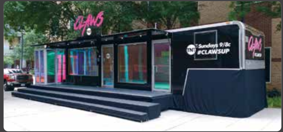
40' EXT GOOSENECK NAIL SALON