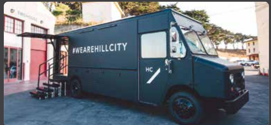
24' STEP VAN / POP UP RETAIL