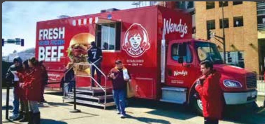
28' BOX TRUCK / MOBILE KITCHEN NCAA SPONSORSHIP