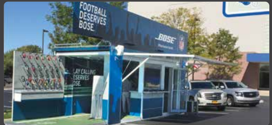
28' PATENTED DROP TRAILER