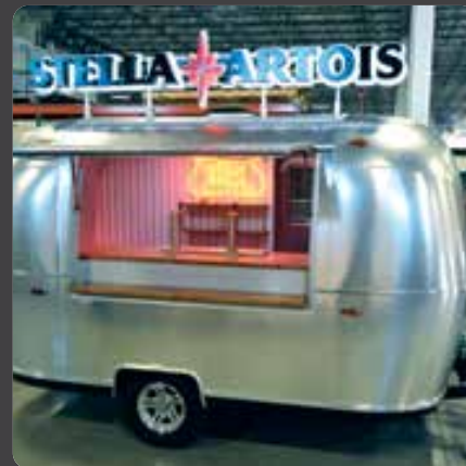
16' BAR / SAMPLING