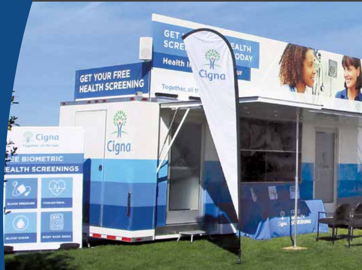
38' PATENTED DROP TRAILER / HEALTH SCREENING