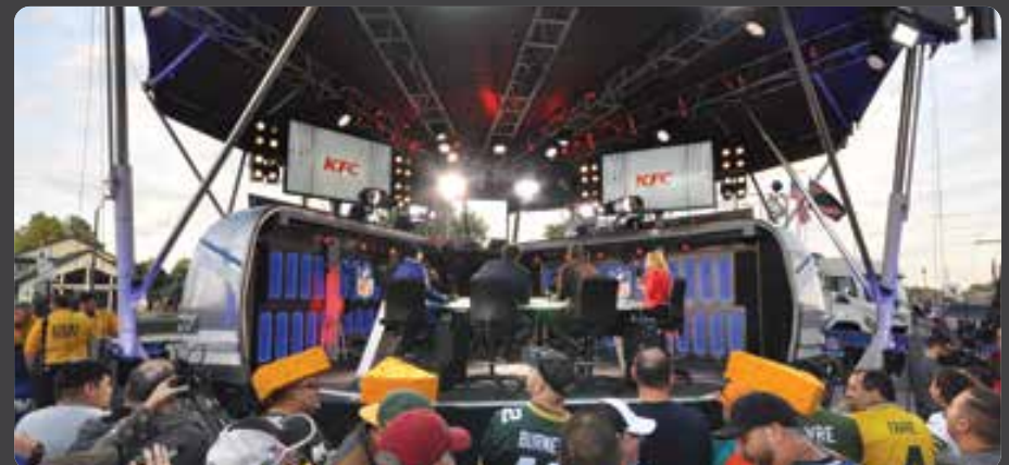
EXPANDABLE AIRSTREAM / LIVE TV SET