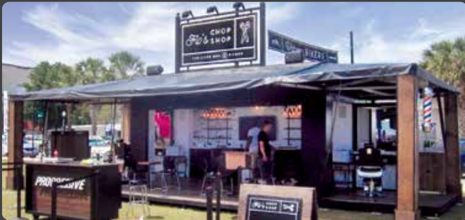
20' EXPANDABLE SHIPPING CONTAINER / BARBERSHOP