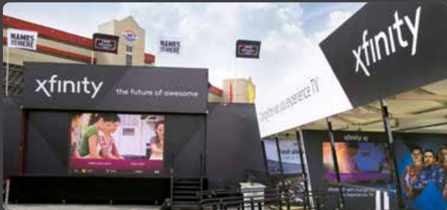
40' CONTAINER AND 53' SEMI / INTERACTIVE EXPERIENCE