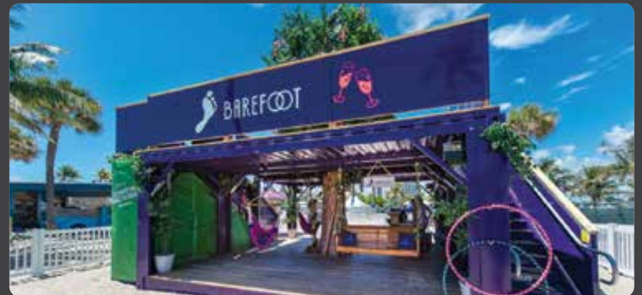
20' X 20' CONTAINER WITH ROOF TOP DECK / CONCERT TOUR