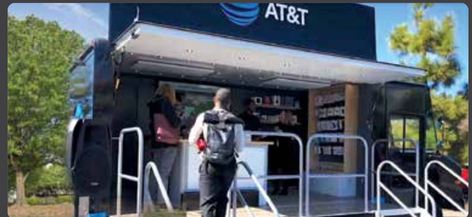
20' STREET VAN "POP UP SHOP" CGS EXCLUSIVE