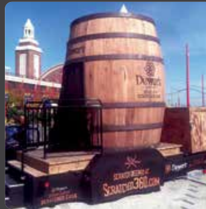
18' TRAILER / CUSTOM 4D EXPERIENCE