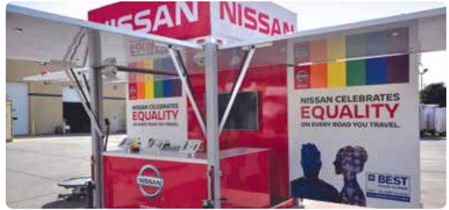
OPENS TO 16' AND 24' IN 20 MINUTES