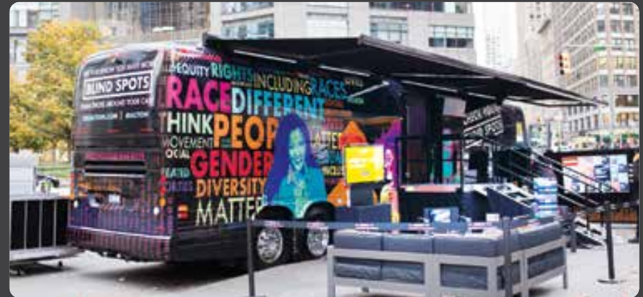
45' EXPANDABLE COACH / NATIONAL AWARENESS TOUR