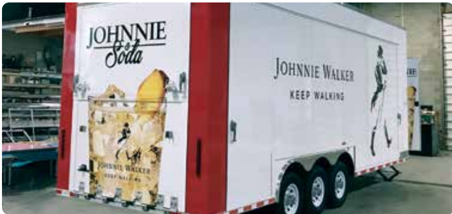
BUMPER PULL LOUNGE TRAILER