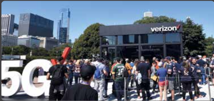
20' X 20' ARCHITECT SERIES / ONE DAY NFL KICKOFF EVENT