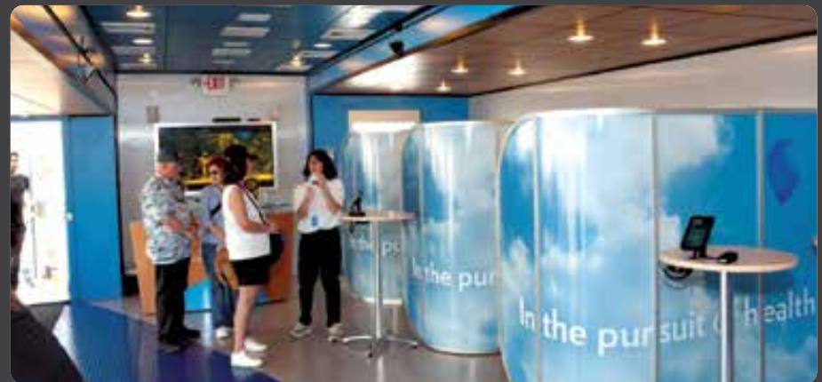
53' DOUBLE EXPANDABLE SEMI SCREENING