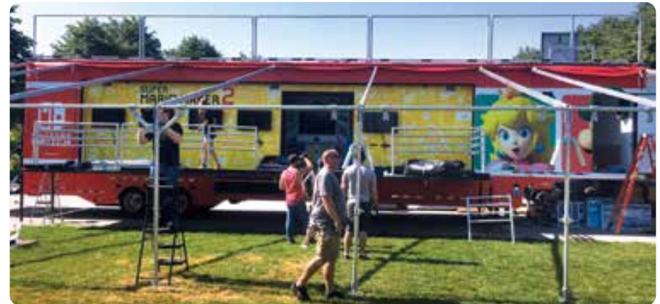
32' FOLD OPEN STAGE UNDER AWNING