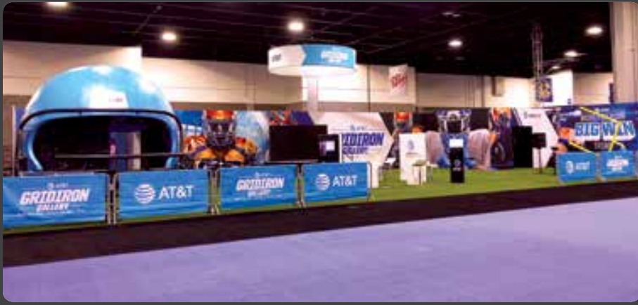
100' X 60' INDOOR SEC CHAMPIONSHIP EXPERIENCE