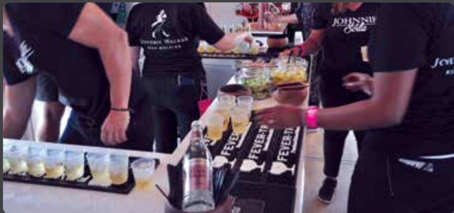
30' EXT / SAMPLING