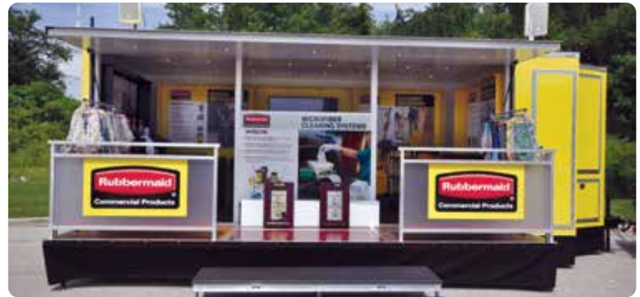
OPEN AIR DESIGN SETS UP IN 20 MINUTES