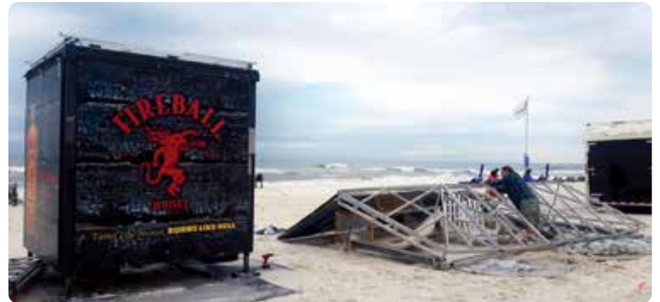
QUICK SETUP VS. BUILDING ON SITE