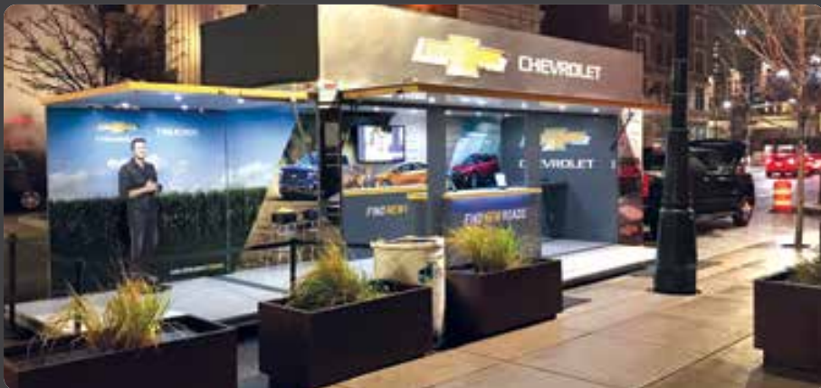
24' DROP TRAILER / DEALERSHIP