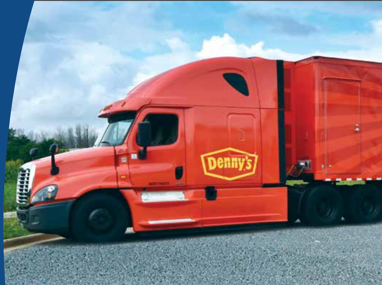
DISASTER RELIEF 53' SEMI