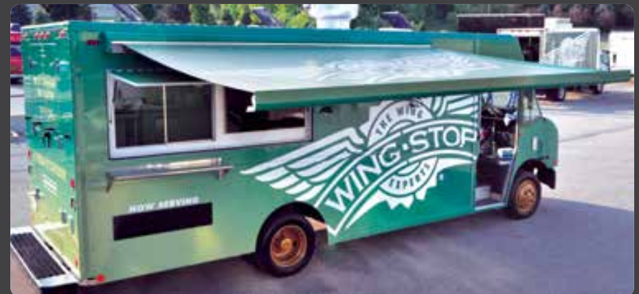
22' KITCHEN STEP VAN FOR SAMPLING PR