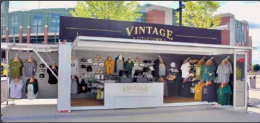
28' PATENTED DROP TRAILER / POP UP RETAIL