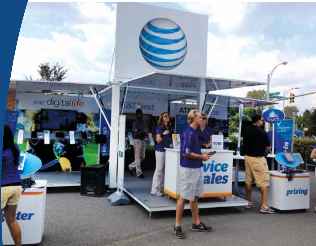
OPENS TO 24' X 16' OPEN FOOTPRINT