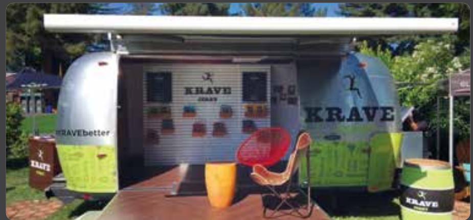
STAGE / LOUNGE SAMPLING