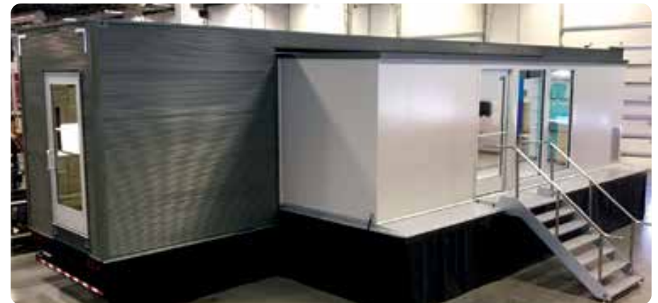
REAR ADA WHEELCHAIR ACCESS