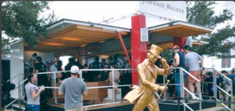
30' EXT / LOUNGE