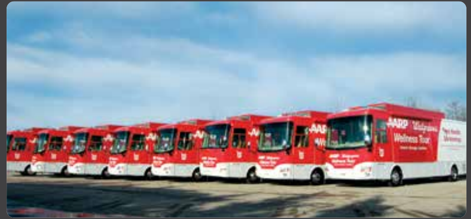
38' EXPANDABLE COACH / HEALTH SCREENING