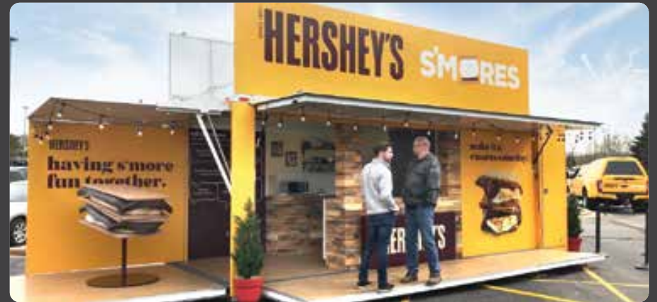
24' PATENTED DROP TRAILER / SAMPLING