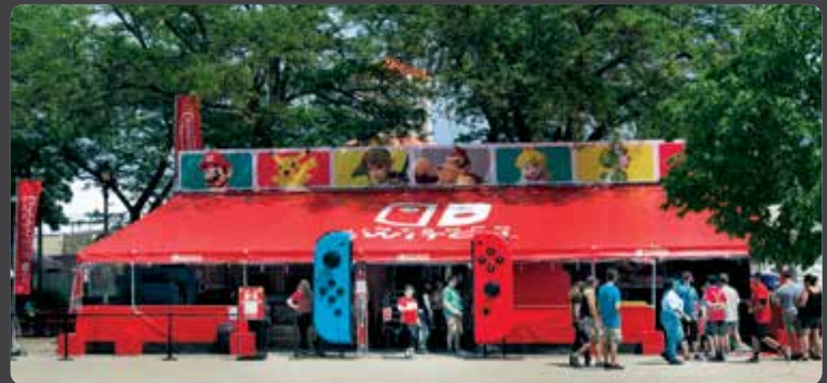
53' EXPANDABLE STAGE TRAILER / GAMING EXPERIENCE