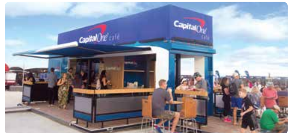
3 SIDED / SOUTH BEACH, MIAMI