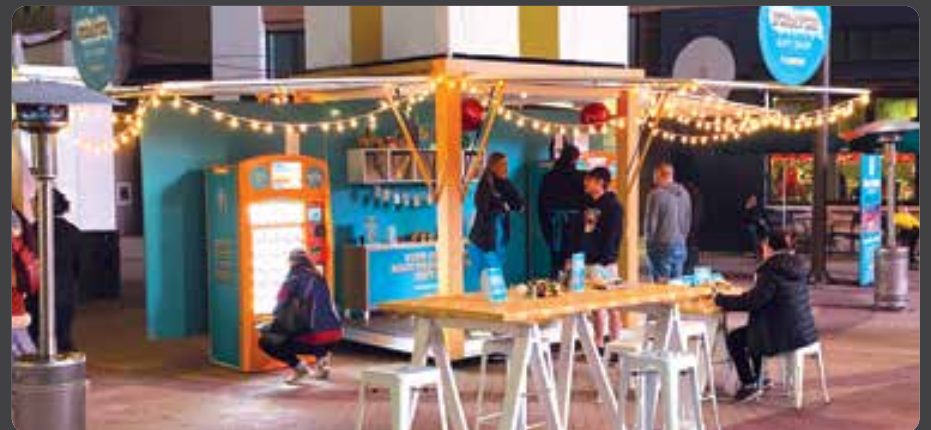
CALIFORNIA LOTTERY 8' POD