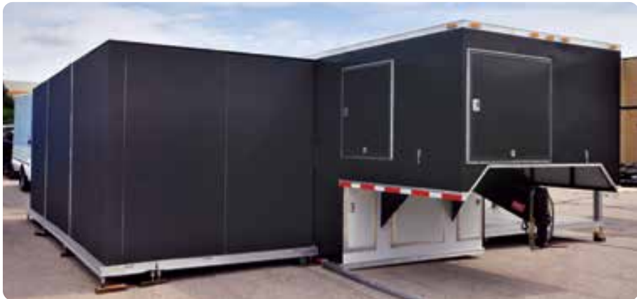
EXPANDABLE DROP TRAILERS