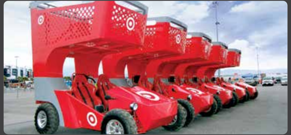
CUSTOM BUILD / ALUMINUM SHOPPING CARTS